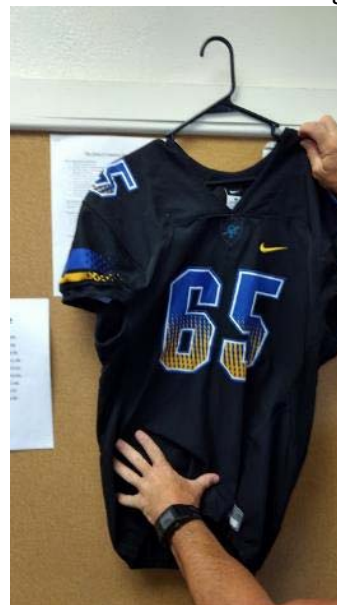
Carlisle dark with blue and gold number