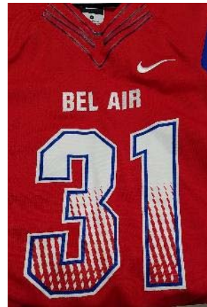
El Paso Bel Air